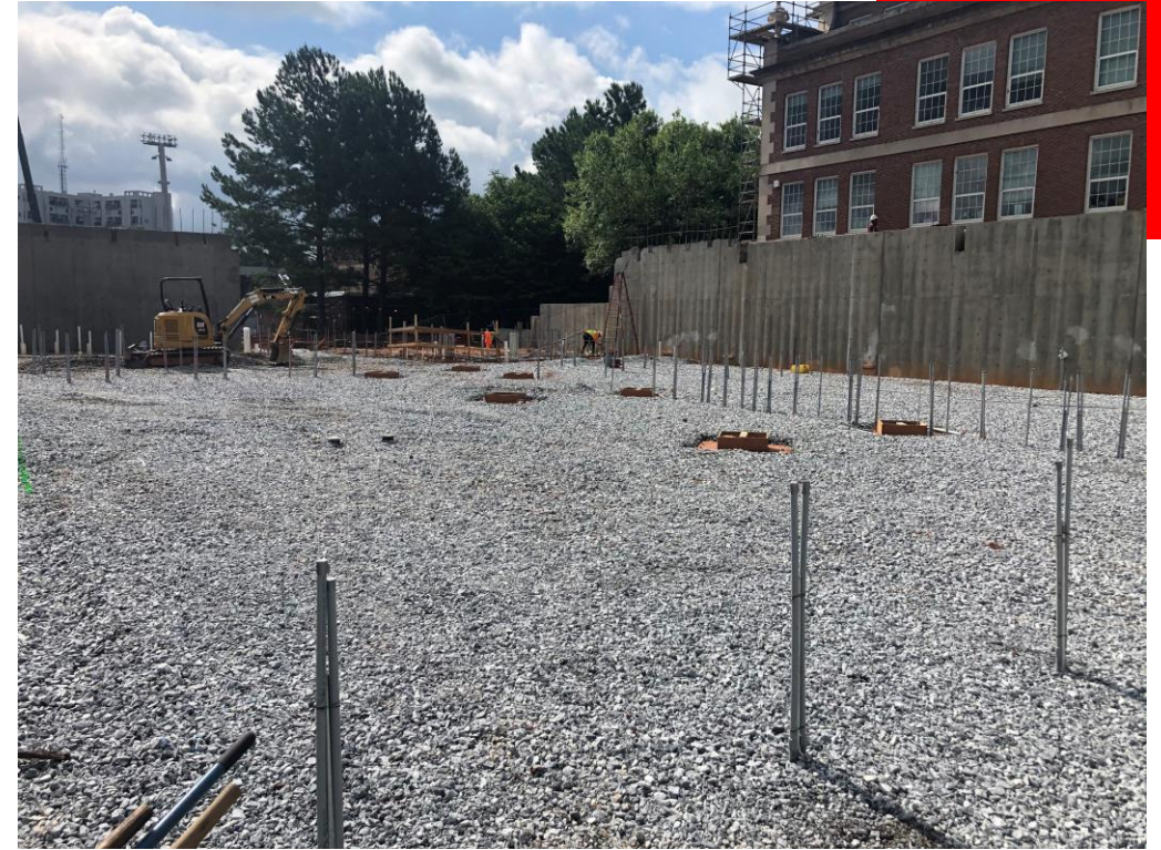
First Floor of New Addition Slab Prep