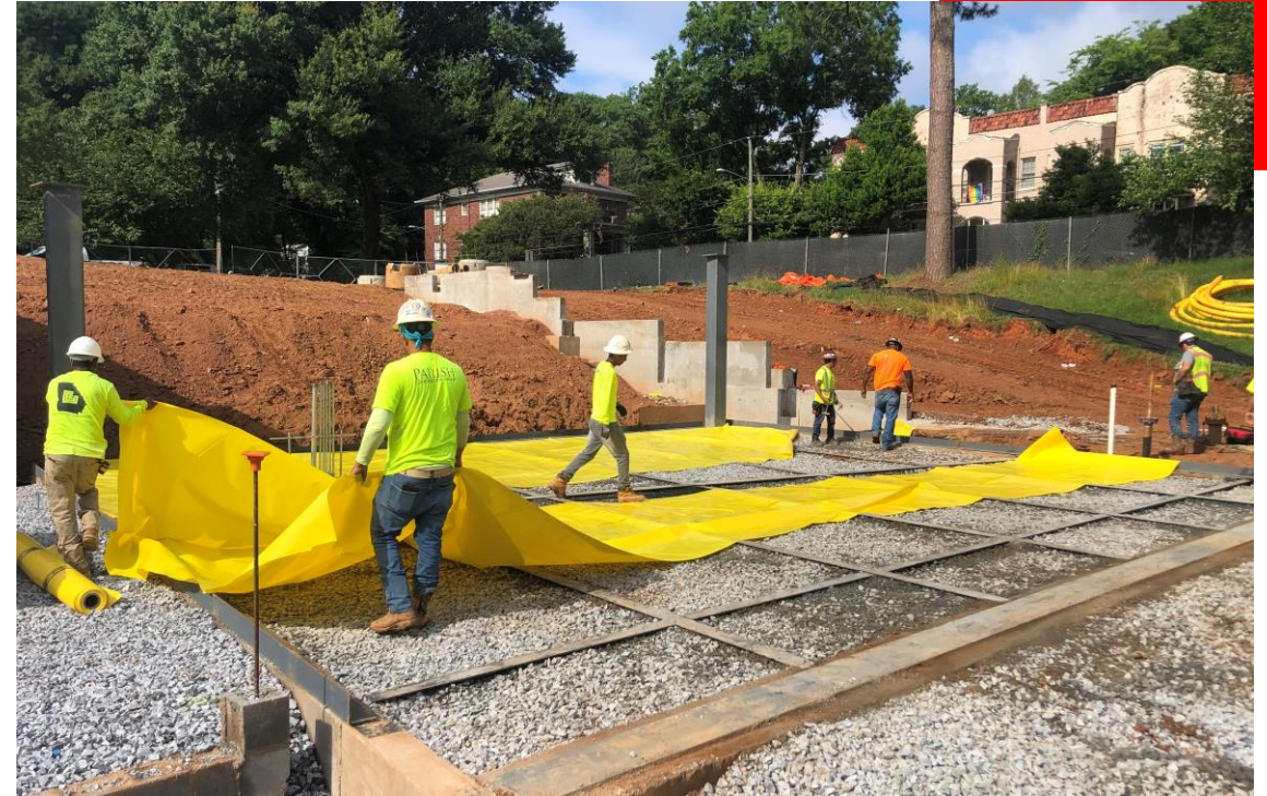
Installing Vapor Barrier at basement of New Addition Building