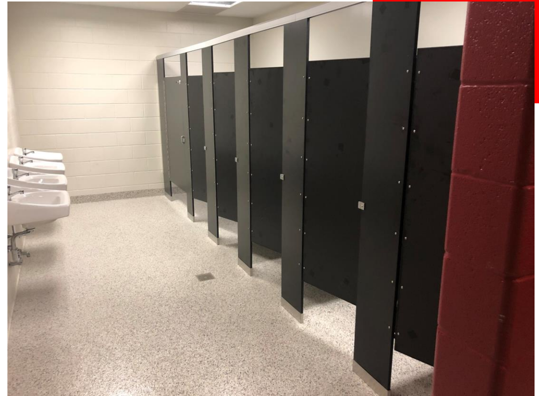
Toilet Partitions completed in 8 th Street Building