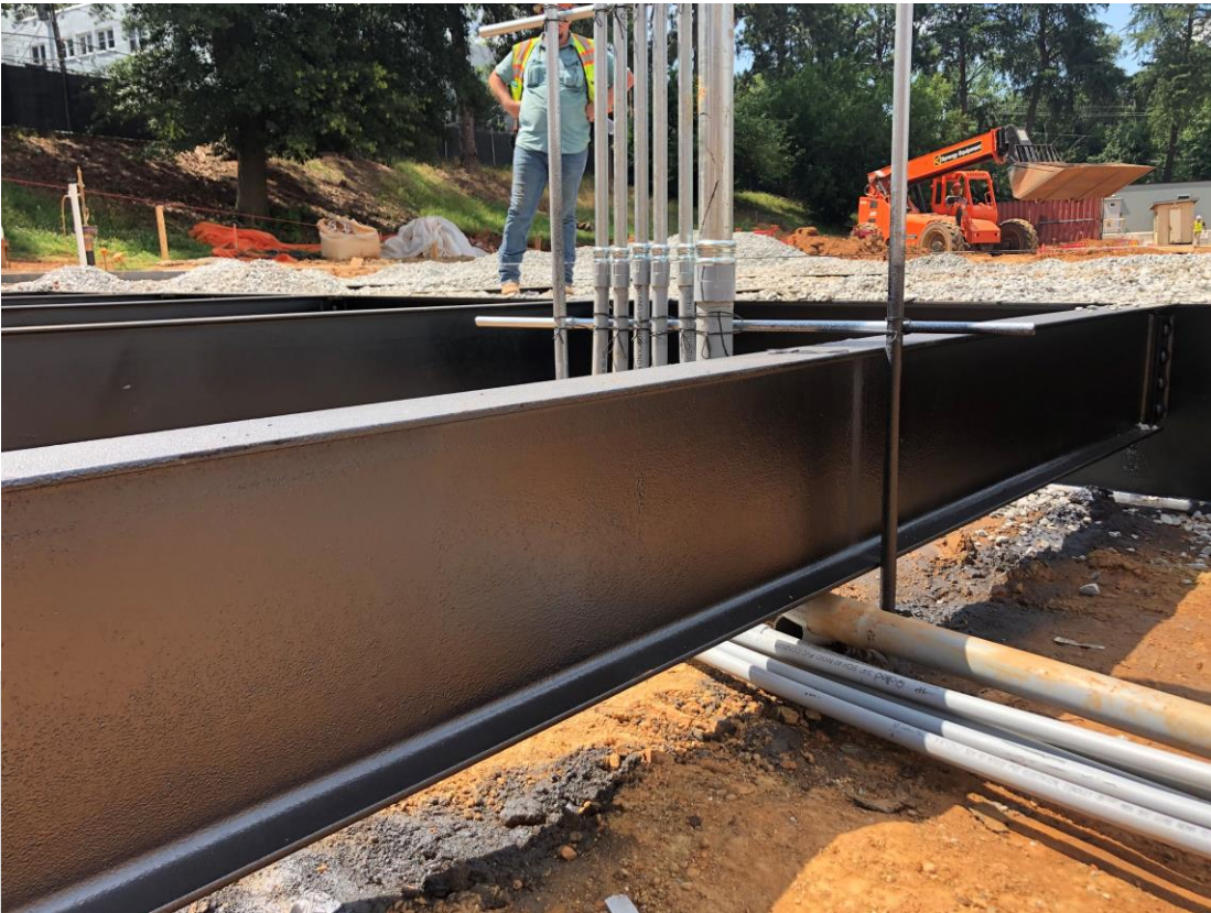
Basement Steel Primed and Painted