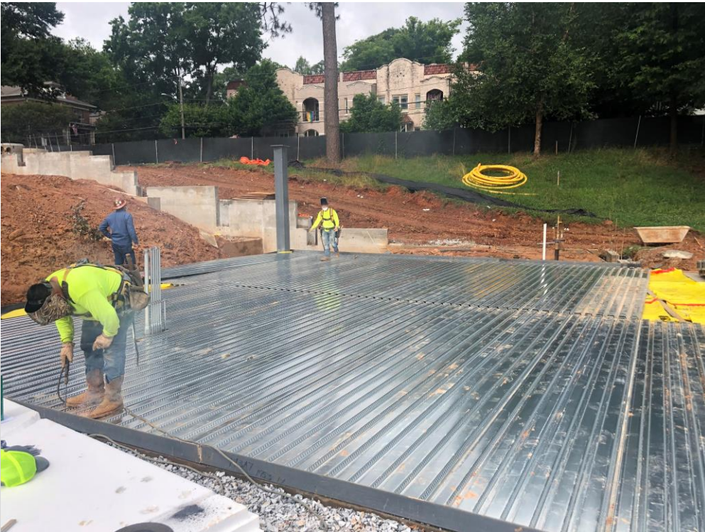
Decking installed in New Addition Basement